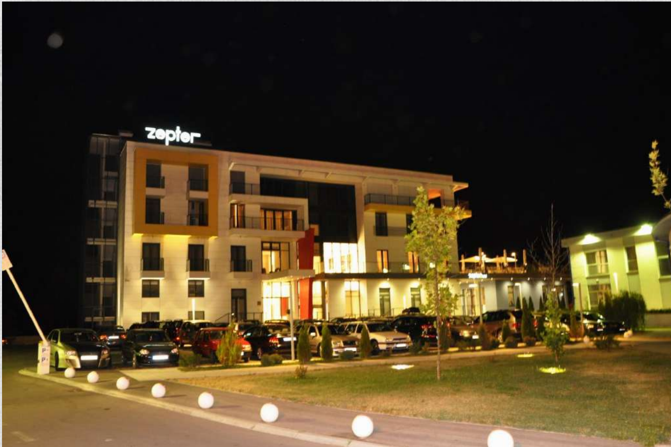
Zepter Hotel – by night

PLACE - PRICE - POTENCIAL - PROVED - PLEASANT