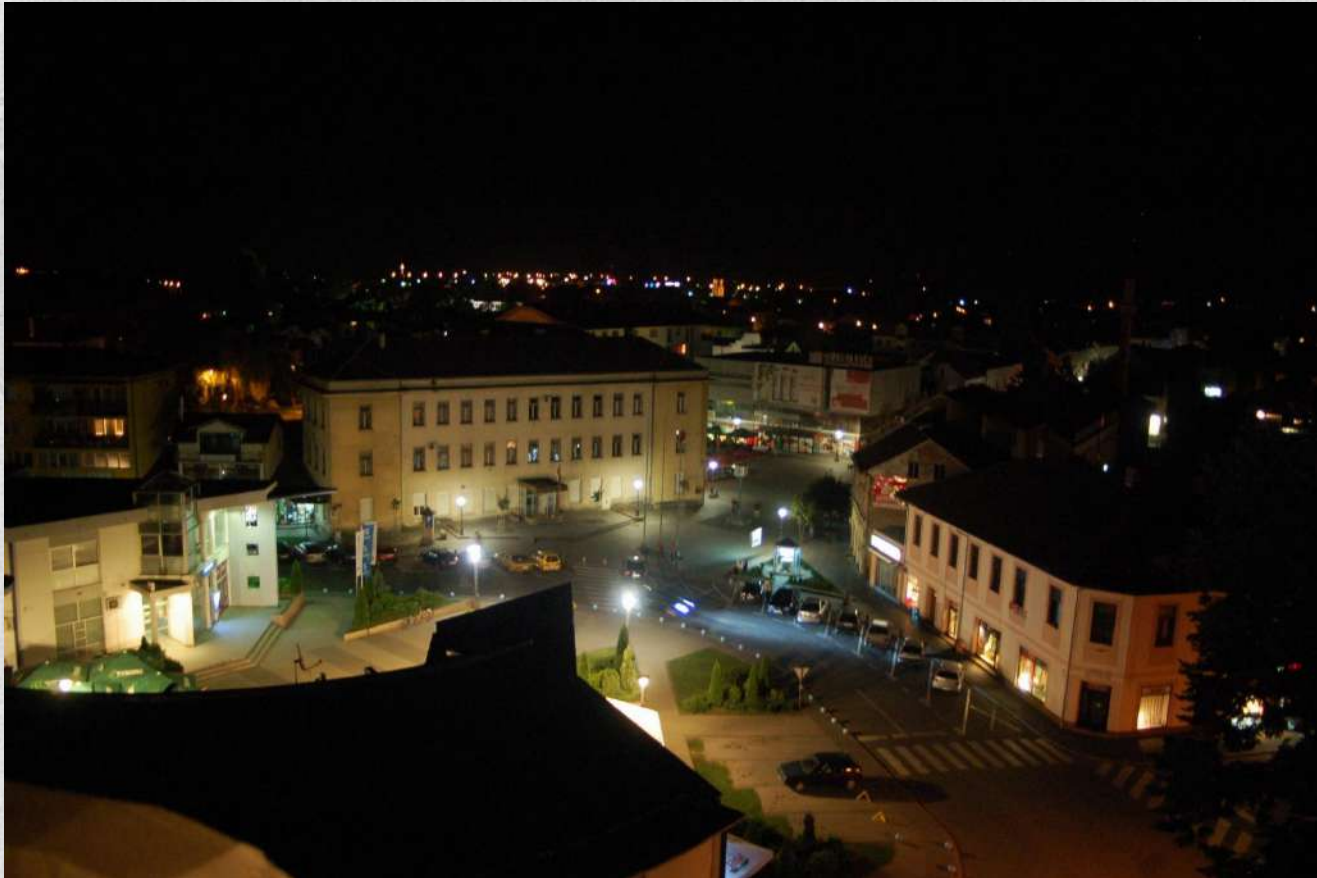
Centre of Kozarska Dubica

PLACE - PRICE - POTENCIAL - PROVED - PLEASANT