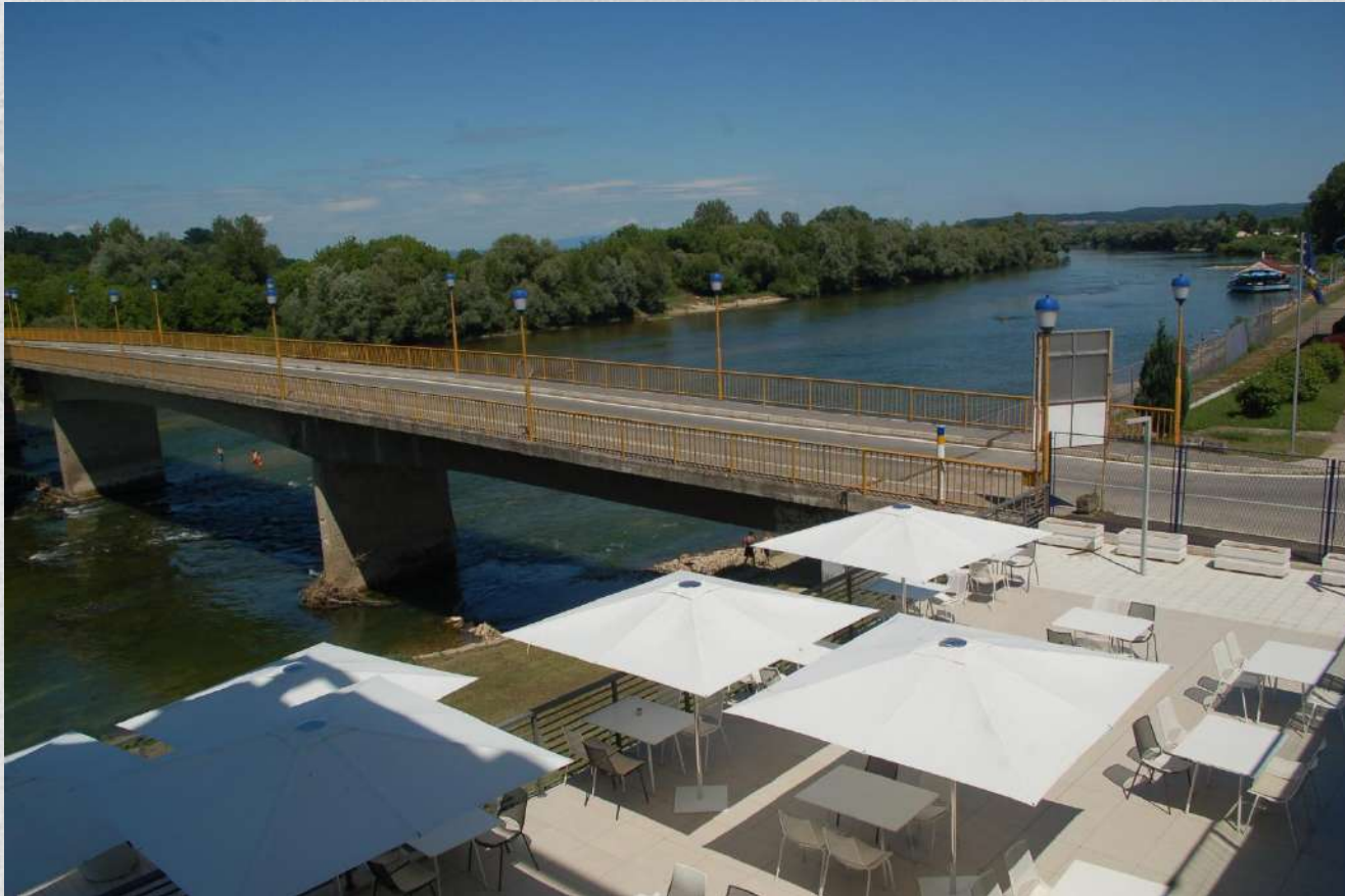
Una River- the bridge and the border crossing

PLACE - PRICE - POTENCIAL - PROVED - PLEASANT