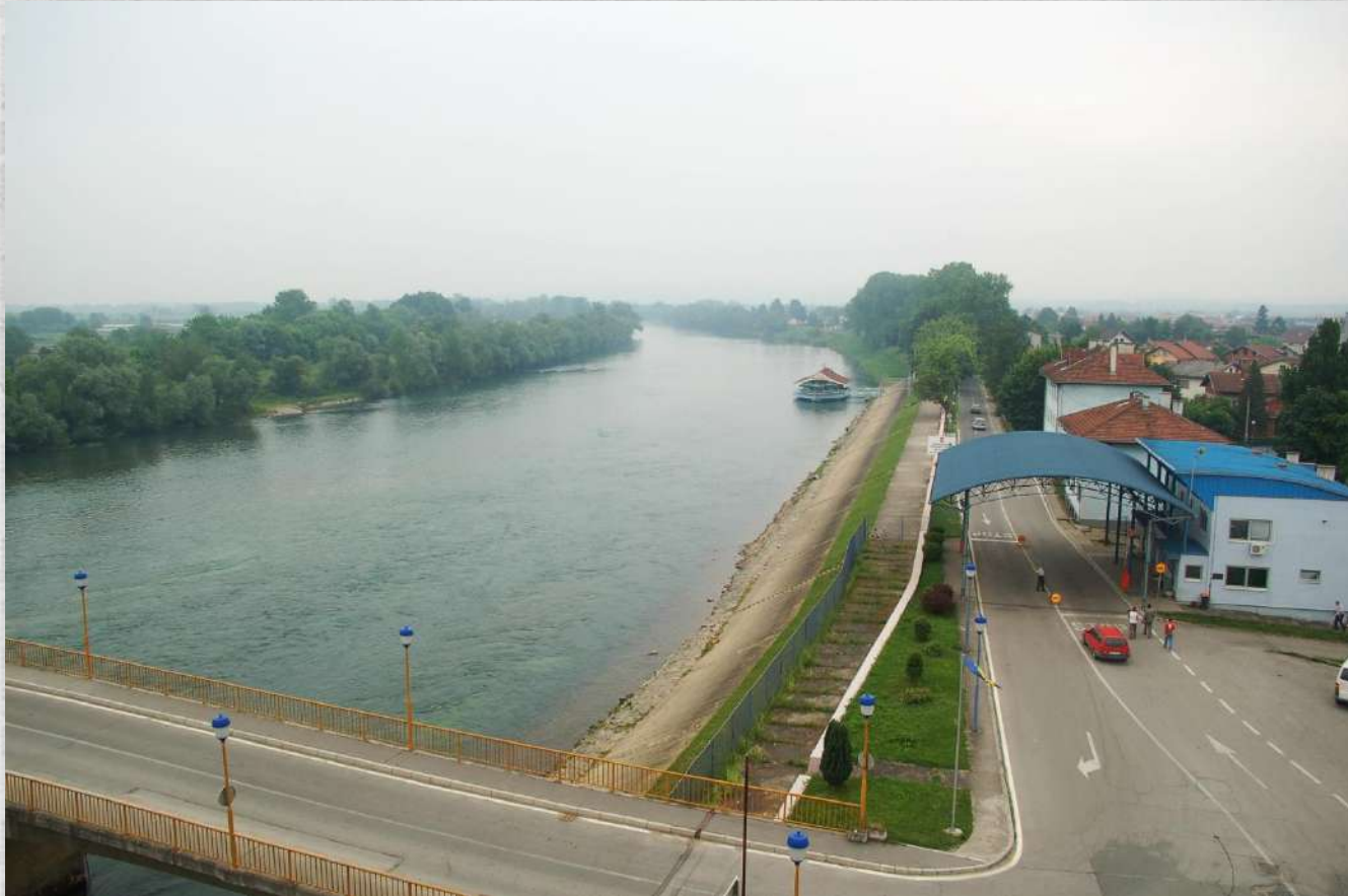
View of Una River and the border crossing

PLACE - PRICE - POTENCIAL - PROVED - PLEASANT