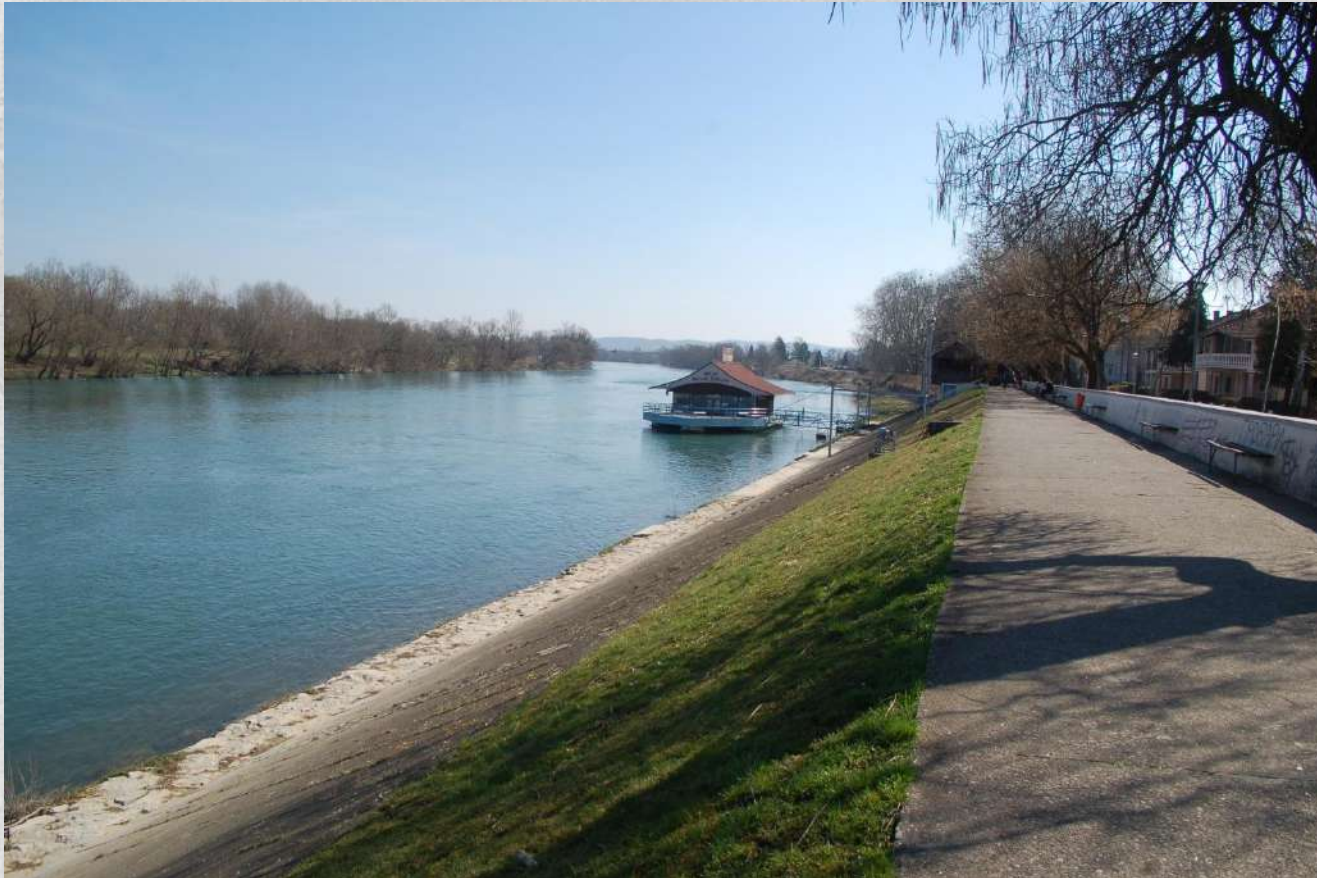
Una River, walking path

PLACE - PRICE - POTENCIAL - PROVED - PLEASANT