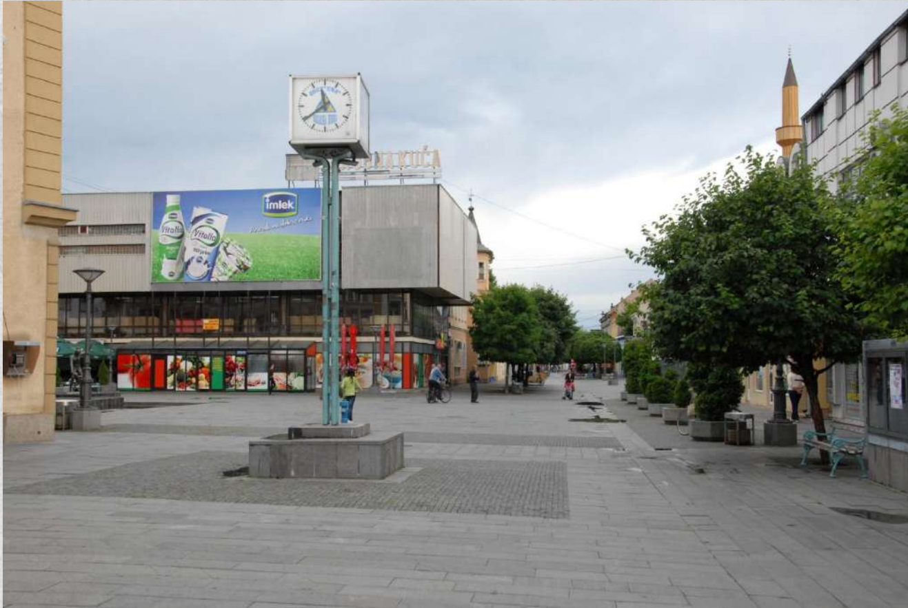
View of walking area