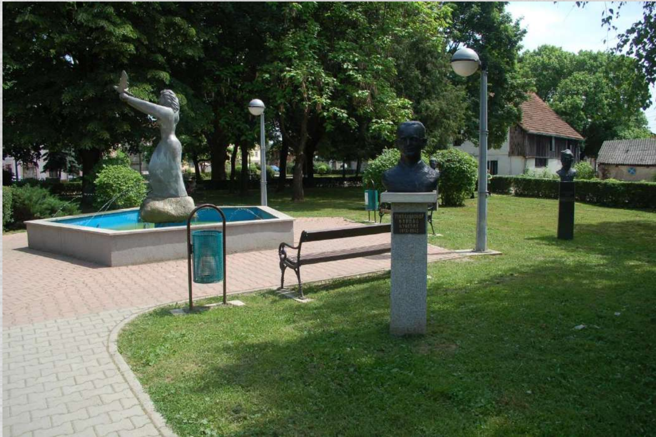
Detail from Town park