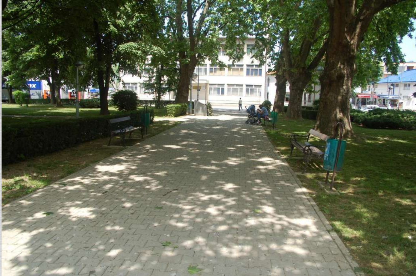
Detail from Town park