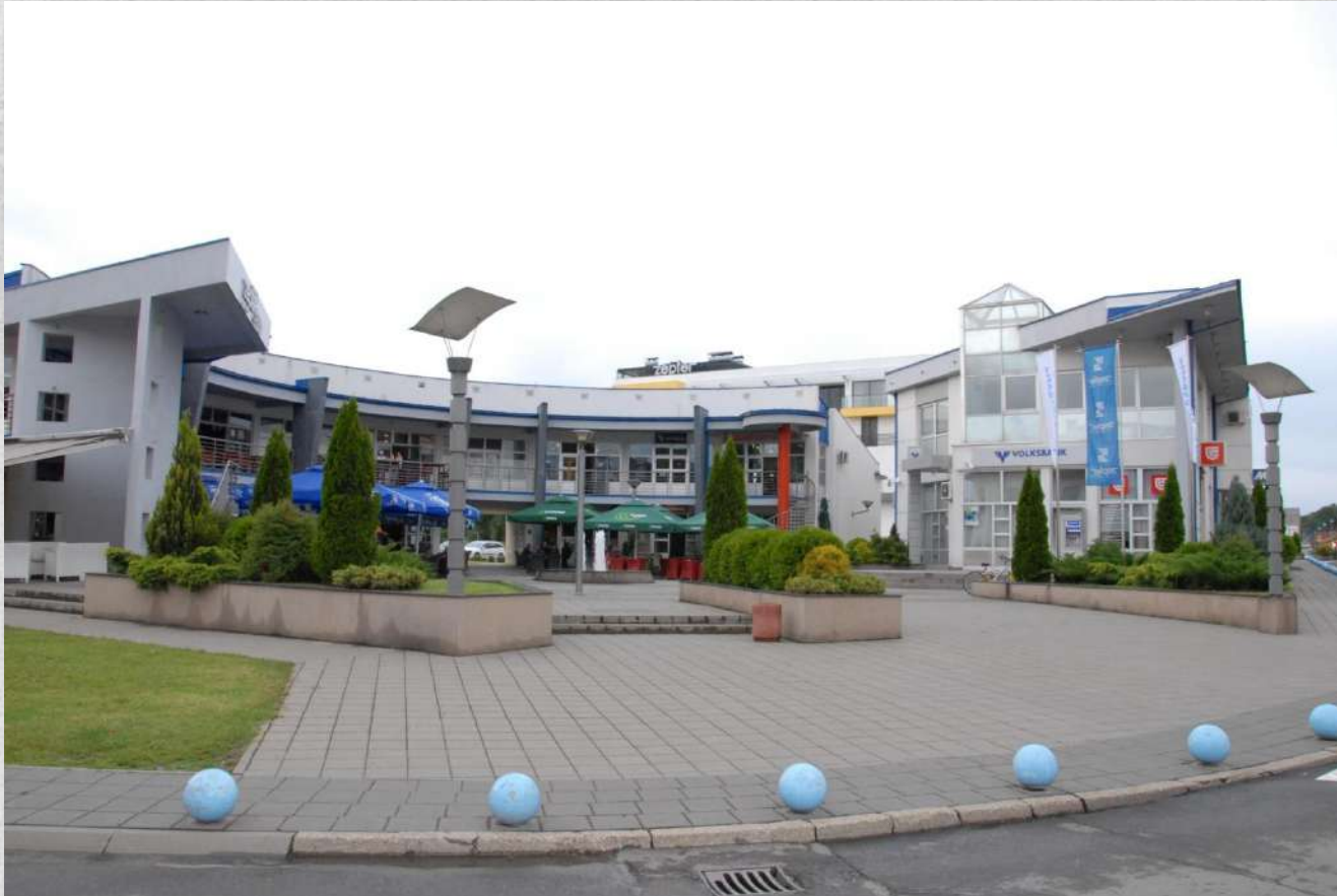
Shopping centre Zepter Plato

PLACE - PRICE - POTENCIAL - PROVED - PLEASANT