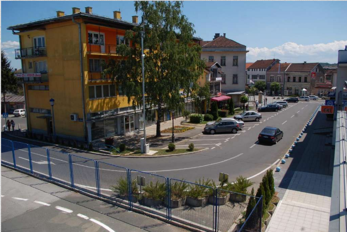
Detail from town centre